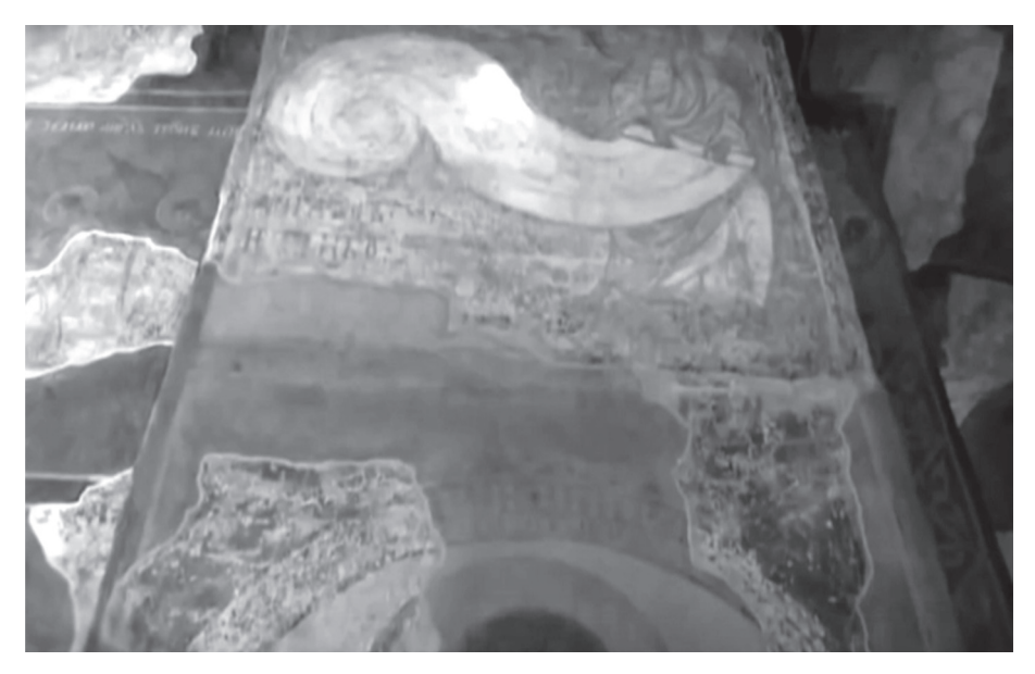
Fig. 1. The Kyrylivska church ( St. Cyril's Church ), Kyiv. The monument of architecture and monumental mural painting (12th century) of the universal significance. The Angel rolling the heaven in a scroll. The Last Judgment. A fresco of the 12th century. The east pylon of the south pillar of the narthex. Photo of "Ukrrestavratsiya" corporation, 2019.

An object of restoration is categorised into the architectural and constructive system, exterior, interior, equipment and monumental-decorative art (the category of works of art can be applied to everything, except the architectural and constructive system, concerning components and details – wall paintings, paintings, sculpture, etc.) To systematize the approaches to preserving the authentic form of works of art, a systematic approach is used, which allows us to imagine the presence of works of art-decor elements on various parts of the exterior surfaces of restoration objects and in interiors.