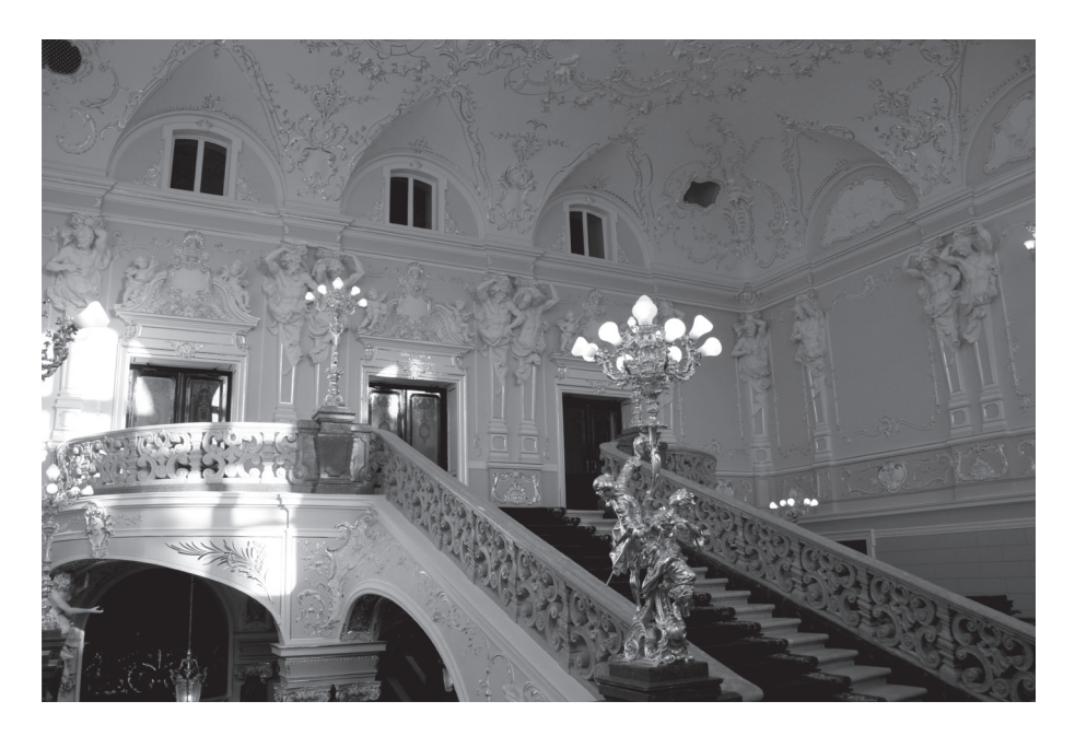
Fig. 5. Odessa National Academic Opera and Ballet Theatre. The white stairs. Photo of "Ukrrestavratsiya" corporation, 2007.

chandelier, lamps, candelabrum, by authors' designs)<sup>23</sup> (fig. 5). Characteristic of this period is the decoration of walls, ceilings, columns, stairs, tiers, lobbies, aisles to the lies of spectacular buildings with sculptures of cupids, putti, Atlantes, muses, satyrs, stucco ornaments with gilding. According to the author's sketch of the artist A. Golovin, a theatre curtain was created. The most luxurious room of the best opera houses is the auditorium, where the ceiling can be decorated with tempera or oil painting (the ceiling of Odessa Opera Theatre is decorated with four paintings of the artist F. Leffler with the scenes from Shakespeare's plays, and in the centre of the ceiling there is a unique large chandelier). In the decoration of staircases, it was used mosaic floors with a pattern, stair railing made of multicolour artificial marble.