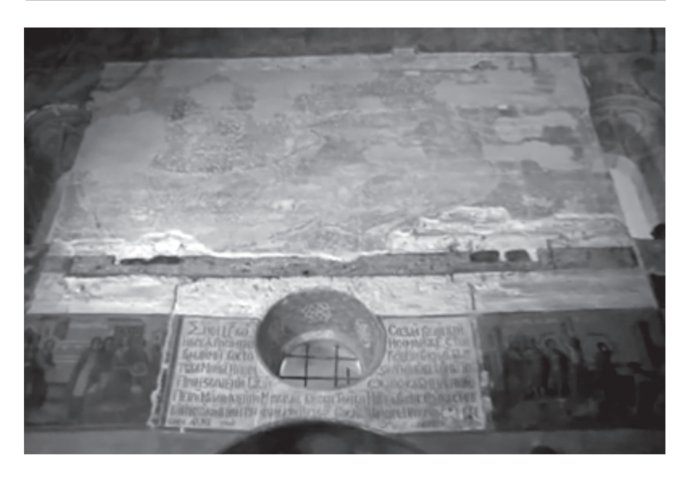
Fig.4. The Church of the Saviour at Berestovo, an architectural monument (11th-12th centuries), Kyiv. 'Miraculous Fishing'. ("Christ's Appearance to the disciples on the Sea of Tiberias"). The frescoe of the 11th century.

The evolution of interior changes often proceeded in parallel with the facade changes, however, the facade kept its stylistic colouring for a long time, while the interiors experienced significant changes, each new building owner made individual adjustments.