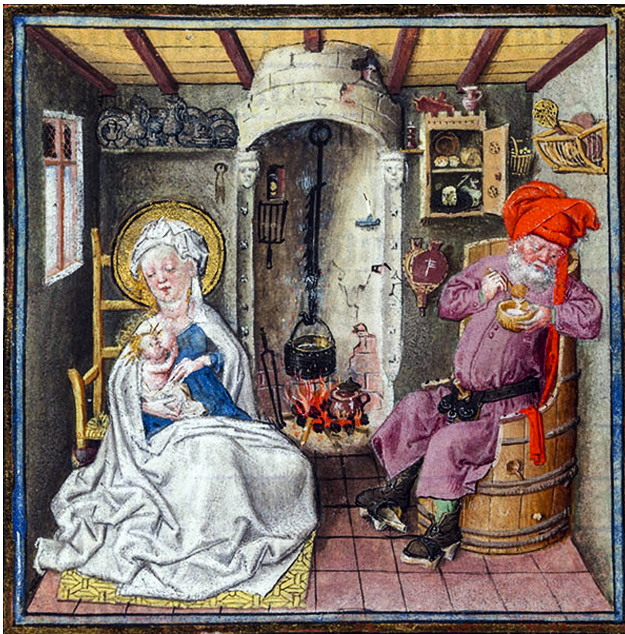
Fig. 1. The Holy Family at supper. An illustration from The Hours of Catherine of Cleves , a manuscript created in the Netherlands ca 1440.

Today found in the collection of the Morgan Library & Museum in New York. Public domain