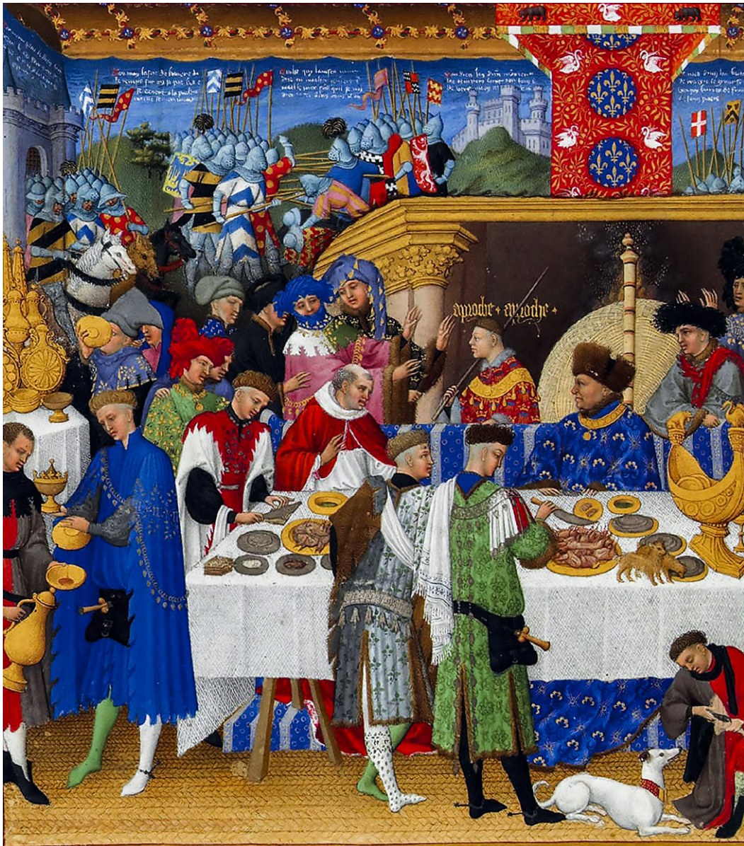
Fig. 6. January , a miniature from the manuscript of the Limbourg brothers The Very Rich Hours of the Duke of Berry , created ca 1410. Today kept in Musée Condé. Public domain

I have also managed to find representations of andirons in manuscript illustrations showing the life of ordinary people, which may suggest they were quite commonly used. However, as they were made of iron, they definitely were not cheap, so we should only expect them to have been used in rich houses. This can be exemplified by a manuscript illustration from Heures de Charles d'Angoulême . It is a book created around the middle of the 15 th century, currently found in the collection of Bibliothèque Nationale de France and available on its website (Fig. 5)