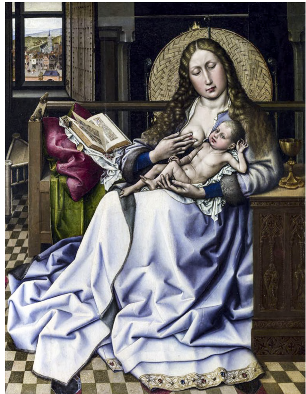
Fig. 4. The Virgin and Child before a Firescreen . A painting created ca 1440 by Robert Campin. Today found in the National Gallery in London. Public domain.

The drawing described above shows a typical fireplace located in a living room also used for preparing meals. The fact that most medieval houses lacked typical kitchens was discussed in my other papers 15 . The illustration also shows an extensive array of kitchenware products. The fireplaces shown usually have only a hook for hanging cauldrons and, in some cases, a spit on supports. Such images can mostly be found in manuscript illustrations depicting the life of ordinary people.