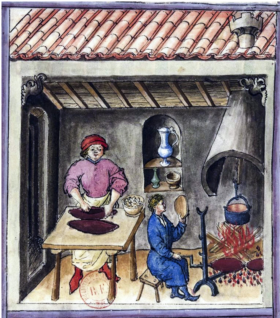
Fig. 2. Ibn Butlan, Tacuinum Sanitatis , Latin translation from the turn of the 14 th century. A copy from the French National Library. Public domain

as this is a completely different issue requiring separate studies.