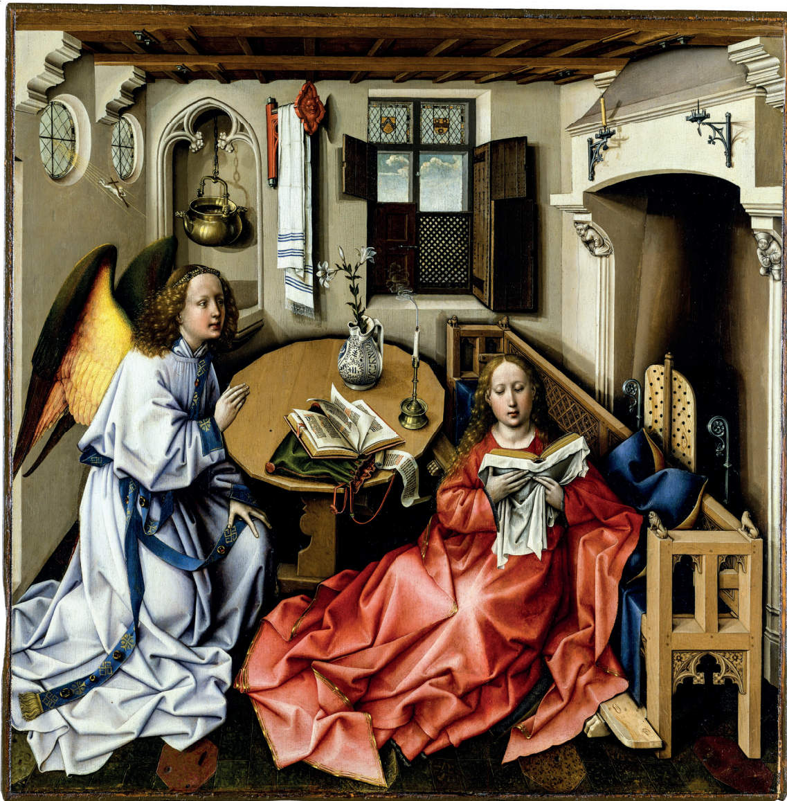
Fig. 3. The middle panel of The Mérode Altarpiece , also called The Triptych of the Master of Flémalle , created by Robert Campin and his students. It was most probably painted between 1427 and 1432 in Tournai (today located in Belgium, earlier located in the Netherlands). Now in the collection of the Metropolitan Museum of Art in New York. Public domain

fire lit level with the floor. Such hearths are usually not separated from the room. Typically, there are cauldrons of different sizes hanging over the fire. They do not hang by a simple chain with a hook but a much more complex mechanism allowing to hang the cauldron on different heights, and so to regulate the temperature. In many cases, a low spit or, sporadically, a gridiron can be seen above the hearth, with a dripping pot underneath. Sometimes, there are more complicated ceramic or iron supports that allowed to place the spit on a selected height. Devices of this type are also uncovered by archaeologists. 11