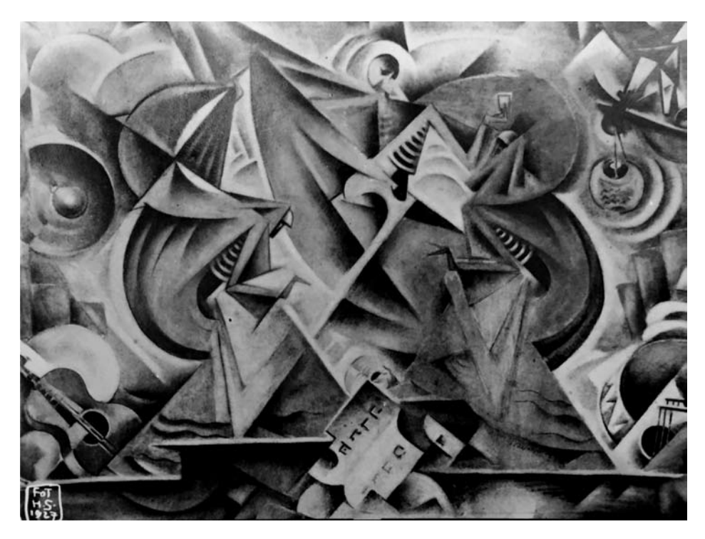
6. I. Lejzerowicz, The masquerade decoration, 1926