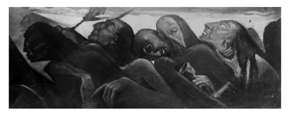
4. I. Lejzerowicz, The procession in Grey (fragment), 1923 / 1925?