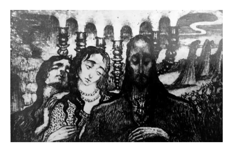
2. I. Lejzerowicz, Sabbatai Zevi, 1924