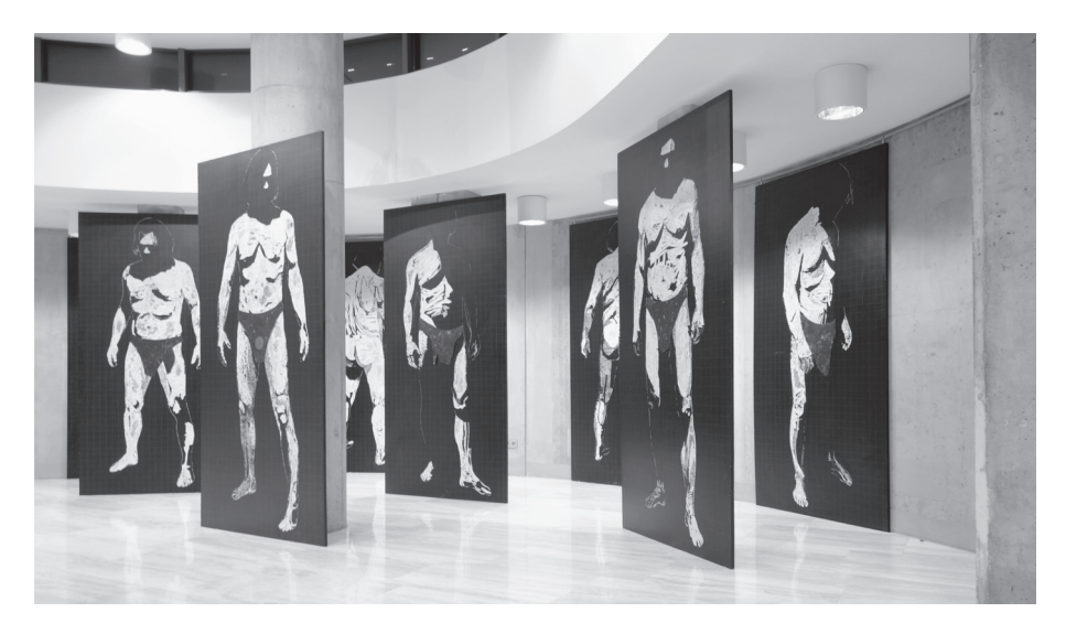
Fig. 4. Exhibition of works by Joanna Trzcińska, Image , Gallery (-1) Olympic Centre, February-March 2016, Warsaw, photo by J. Trzcińska.