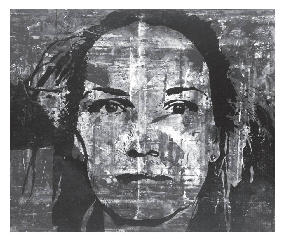
Fig. 2. Joanna Trzcińska, untitled I, digital print, 140x140 cm, 2009, photo by J. Trzcińska

The evolution of the series The Image focuses not only on depicting the human figure as a whole, its fragments or groups in different shots. As the series evolves, the artist experiments with the painting substrate, scale, and the relationship of the work to space. Several series of works created since 2009 and, on a larger scale, since 2014: Nudes and Erotica, Faces, Hands and Janki <sup>14</sup> can be included in The Image series.