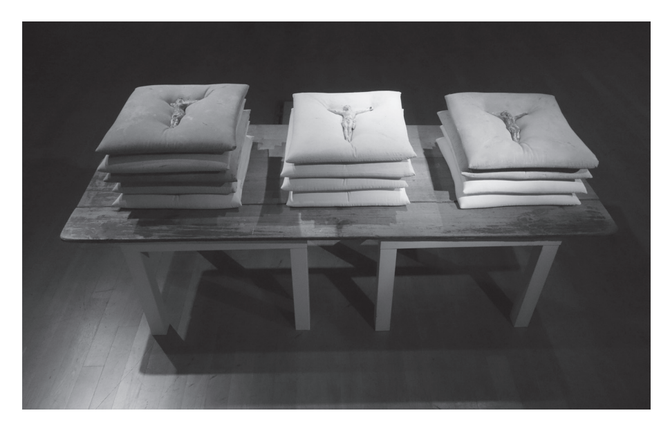
Fig. 6. Joanna Trzcińska, installation from the Lulled series, photo by. J. Trzcińska

from a finished cushion to its cast was not planned: "how many of these cases have to be generated, met, provoked, so that something in the image appears, so that it prompts what to do next (...) it has to be controlled, that is, watched".<sup>27</sup> The cushions, developed in this way, sometimes have the color given to them by the fabric used for the form. This experimentation with different mixtures of stone and granite flours introduces interesting incongruity between the form of the object and its use: a soft cushion is hard.