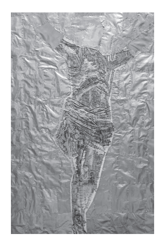
Fig. 5. Joanna Trzcińska, painting from the Passions series