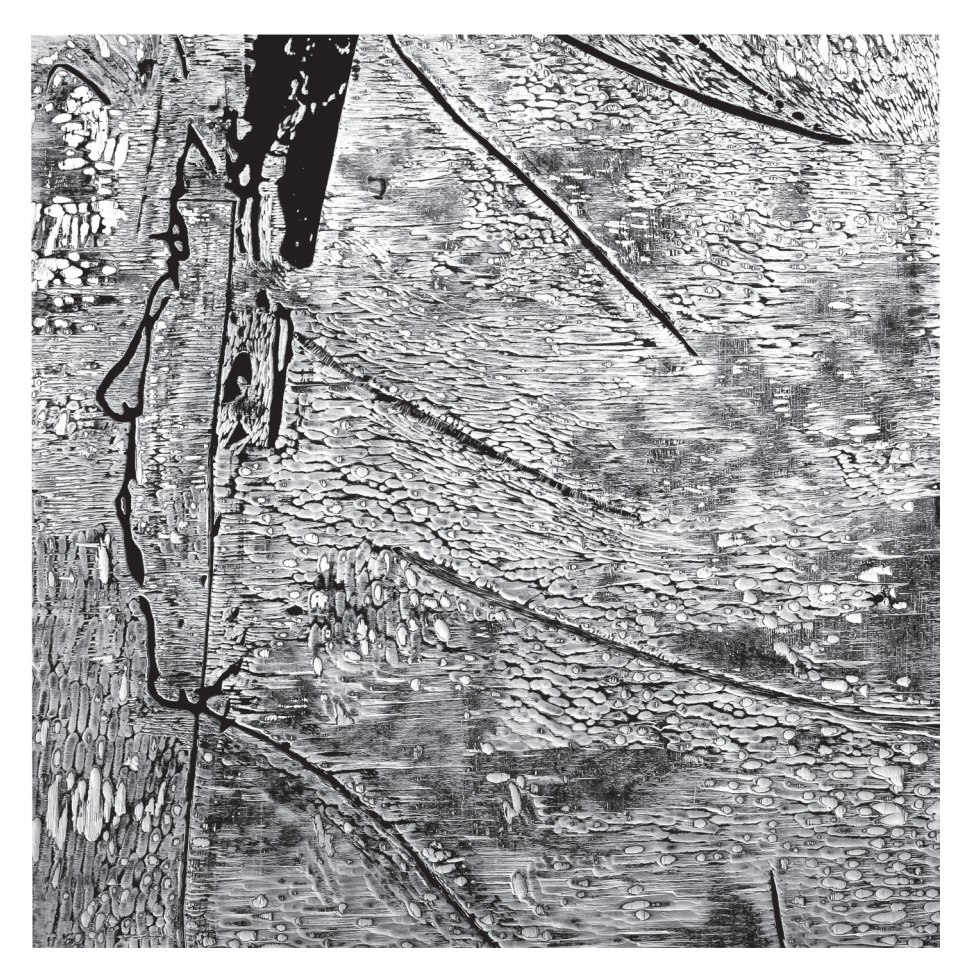
Fig. 1. Joanna Trzcińska, untitled, woodcut on digital print, 100x120 cm, 2014

cut matrix. The works are still representational, but also the matter, the third dimension becomes important, which brings the realizations closer to sculpture. In addition – I use paint, for the preparation of which I use graphite, which evokes drawing and graphics".<sup>13</sup> Works made using this technique also affect the viewer's senses of touch and smell. The resinous smell of wood and ink is well perceptible, and the artist herself always encourages viewers to touch the matrixes.