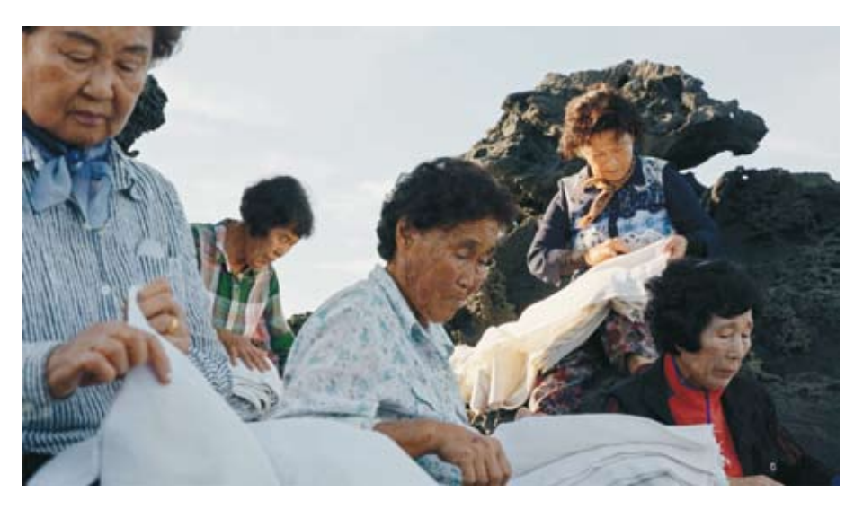
Fig. 6. Still from film Halmang (2023), by Jane Jin Kaisen.