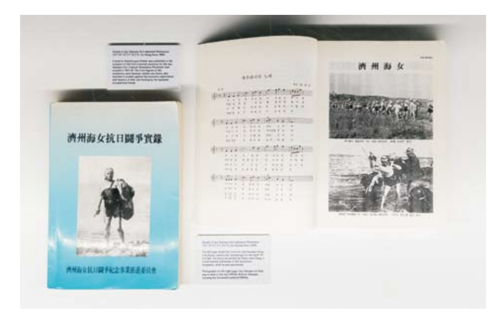
Fig. 7. Installation view of Jane Jin Kaisen: Halmang at esea contemporary, Manchester, 2024, showing detail of archive table. On the left - Annals of Jeju Haenyeo Anti-Japanese Resistance (1995), a book by Kaisen's grandfather; in the middle - contents of the book with the score for Jeju Haenyeo Song and photographs of haenyeo (1950s and 1960s).