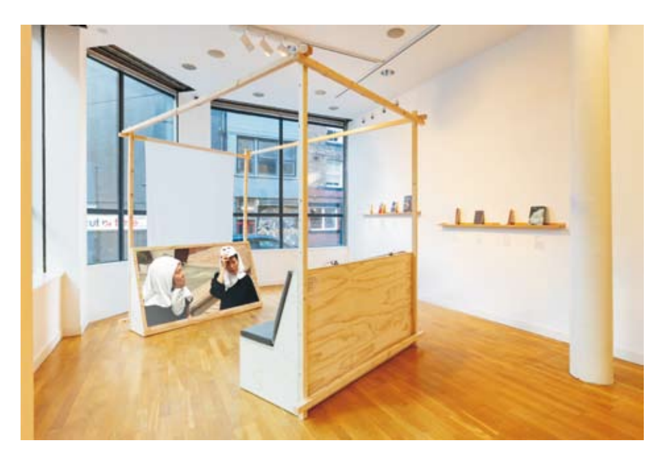
Fig. 3. Installation view of Jane Jin Kaisen: Halmang at esea contemporary, Manchester, 2024. In the foreground, the projected film The Woman, The Orphan, and the Tiger (2010) by Jane Jin Kaisen.