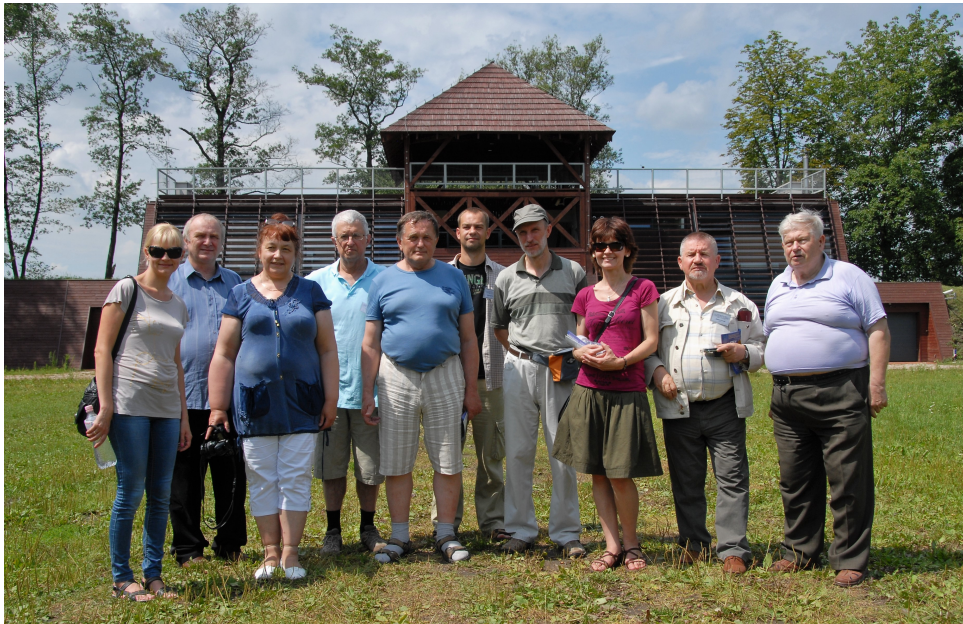
Conference exploratory excursion.