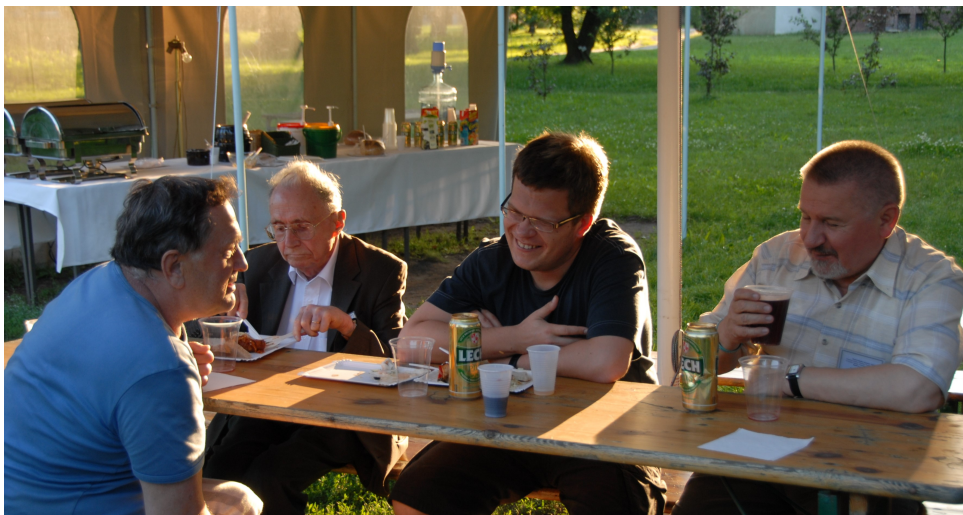
Talks and discussions never end.