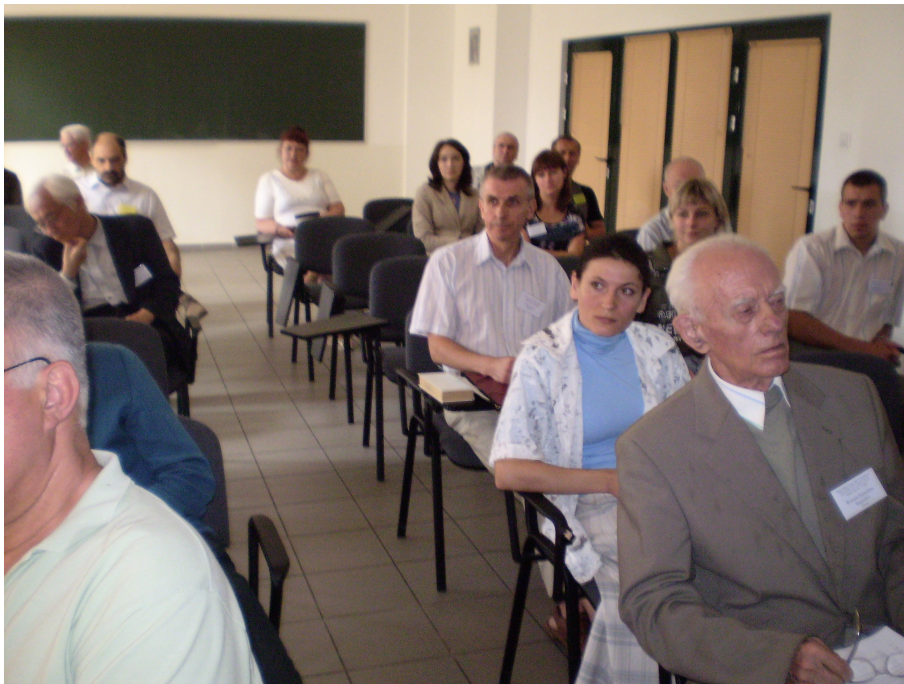
During a lecture