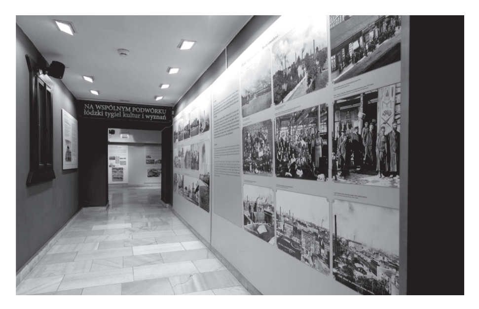
3. Part of the exhibition "In the Common Backyard – Lodz as a Melting Pot of Cultures and Denominations" at the Museum of the City of Łódź

4. The temporary exhibition "A Lodzermensch Sets off on a Journey", occupying the open space of the temporary exhibition gallery located on the ground floor of the museum. It featured partially scenographic presentations of objects related to the leisure time of Lodz residents, placed against a background of large reproductions of archival photographs supplemented by boards with short introductory texts written in simple Polish.