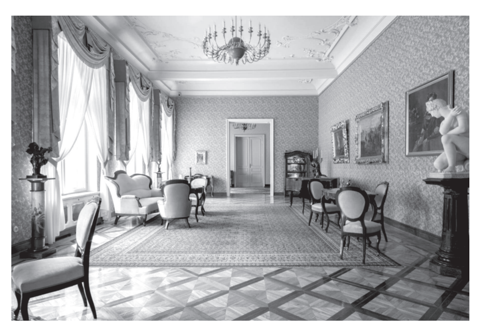
1. Part of the exhibition presented in the historic interiors of the Museum of the City of Łódź

1. Permanent exhibitions presented in the historic interiors (among others, "The History of the Poznanski Family") – rooms of the palace covering part of the ground and first floor. The exhibitions have a scenographic character (the space is filled with works of applied art from the turn of the 20<sup>th</sup> century). The objects have very few captions, some of the rooms lack any captions (Figure 1).