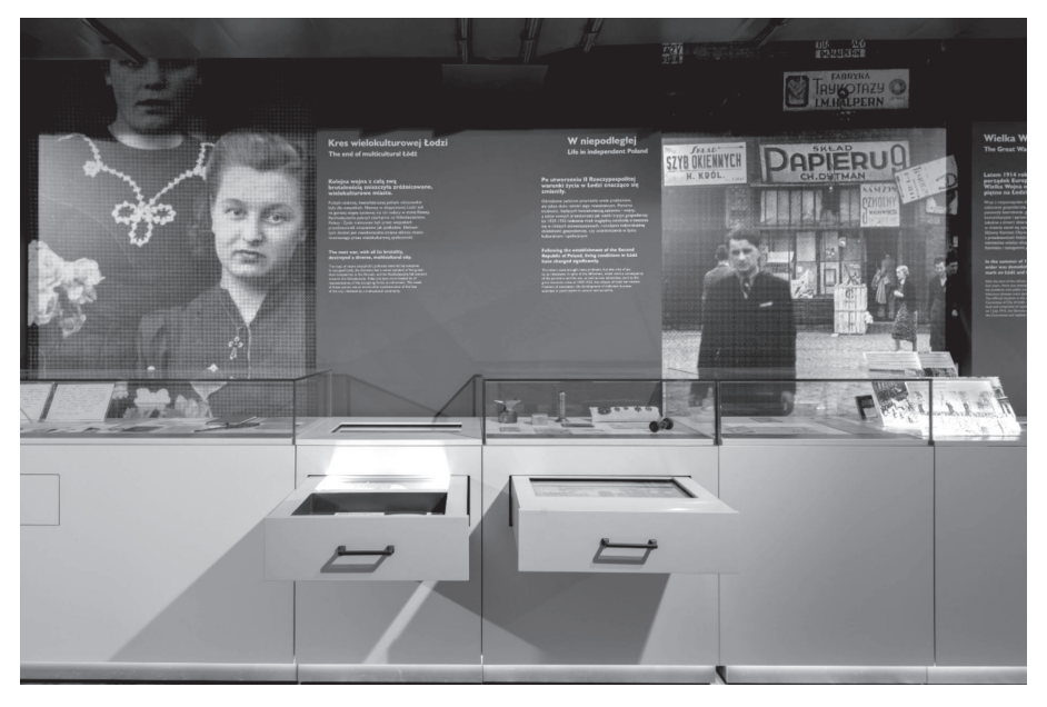
2. Part of the exhibition "Lodz in Europe. Europe in Lodz. The Promised Land Then and Now" at the Museum of the City of Łódź

2. The permanent exhibition "Lodz in Europe. Europe in Lodz. The Promised Land Then and Now", which is an exhibition covering a large open space and is divided thematically into parallel zones. They present the history of Lodz in four domains: People, Metropolis, Progress and Success. Visitors can explore the exhibition following a chronological order, or according to themes. There are no specific paths to follow. In addition to freely available texts (captions, wall charts), some information is displayed with the help of multimedia and other interactive solutions in the form of screens, tablets and information kiosks (Figure 2).